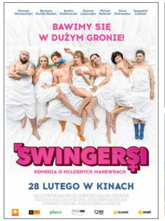
Swingers / What We Don't Talk About / Filmtown Cinevilla