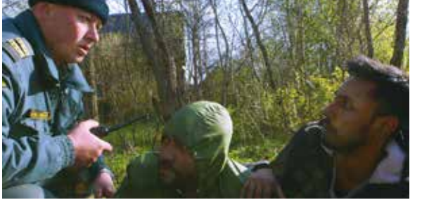
Lumberjacks / Latvian Coyote / Documentarian

Over the last five years, the production company Studija Dokumentālists has presented its films at 56 film festivals around the globe, including New York, New Caledonia, and Moscow. All of its documentaries have been nominated for the 'Lielais Kristaps' national film award.