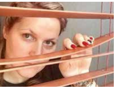
Solving My Mother / 24 Hr Sunshine / My Mother the State

The Latvian film production company FA Filma produces feature films and documentaries with high artistic merit. Their films have won numerous festival awards and are distributed internationally.