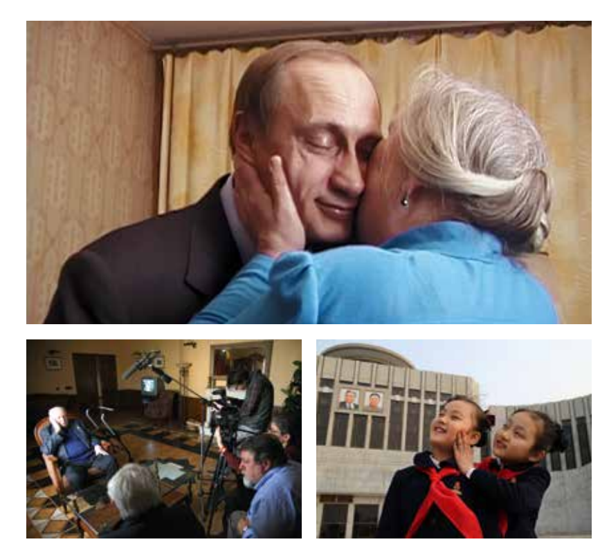
Putin's Witnesses / Gorbachew / Under the Sun

Vertov founded in 1996 was one of the largest independent documentary film studios in Russia. Its catalogue contains more than 200 films and hundreds of TV programs. Since 2014 Vertov studio is registered in Latvia. More than 40 TV programs produced annually. Documentaries produced after 2014 participated in hundreds of film festivals and received more than 50 prizes. Putin's Witnesses was nominated for European Film Awards 2019.