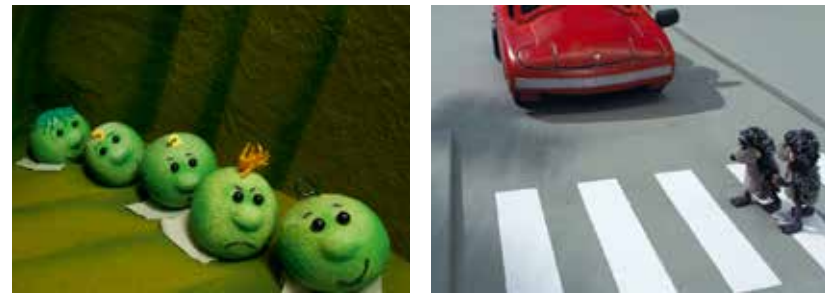
London Holidays / Pea Children / Hedgehogs and the City

Founded in 1996 by Arnolds Burovs, a director of theatre and puppet films, Film Studio Animācijas Brigāde has produced over 100 puppet films. It produces puppet films, puppet film series and commercials.