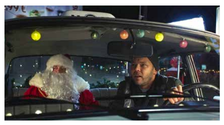
New Year's Eve Taxi 2 In The Land that Sings Loss