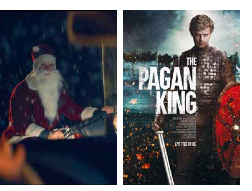
Accidental Santa / The Pagan King

Platforma filma is the most successful commercial movie studio in Latvia. The mission of the company is to create entertaining and contemporary intellectual property, and to engage local audiences with global values.