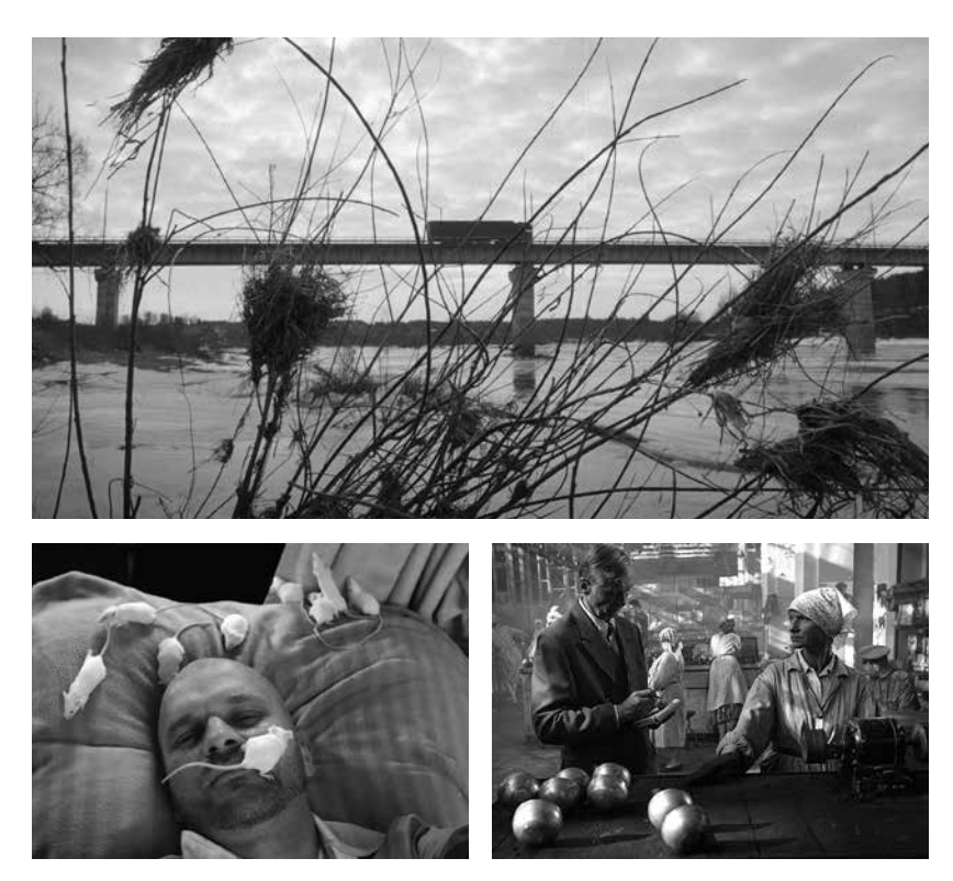
The First Bridge / In the Mirror / The Shoe

Hargla Company was founded in 1997 as its founders were eager to make their own productions. Almost all of its films have won festival awards. 2 were selected for the official programme of Cannes IFF, 2 – for Venice IFF, 2 – for Berlinale, 4 – for Locarno IFF, etc.