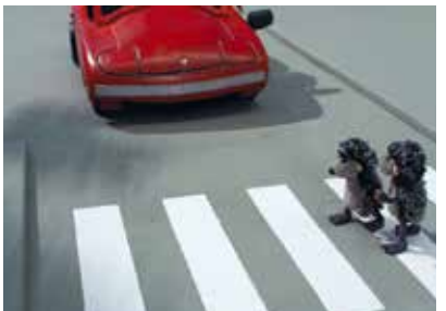
The Dust / Secrets of Paris / Hedgehogs and the City

Founded in 1996 by Arnolds Burovs, a director of theatre and puppet films, Film Studio Animācijas Brigāde has produced over 100 puppet films. It produces puppet films, puppet film series and commercials.