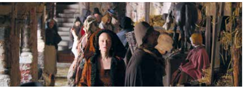
What Silent Gerda Knows / Gulf Stream Under the Iceberg