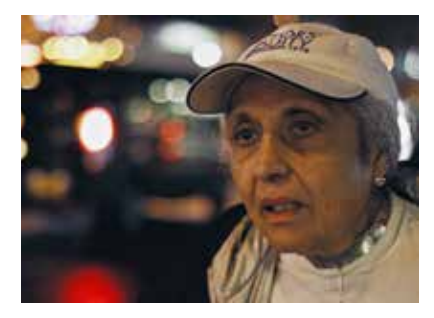
The Man and the Dahlias / Where the Road Leads / One Ticket Please

Deep Sea Studios is an arts collective and film production company based in Riga, Latvia. Founded by young artists and producers, it operates as a platform from which new talents work alongside experienced professionals to create new and enriching artistic experiences.