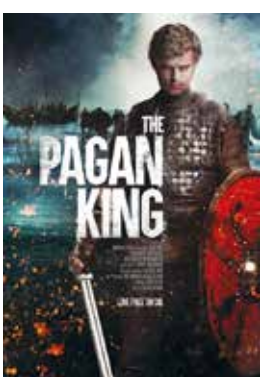
Class Reunion / Swingers 2 / The Pagan King

Platforma filma is the most successful commercial movie studio in Latvia. The mission of the company is to create entertaining and contemporary intellectual property, and to engage local audiences with global values.