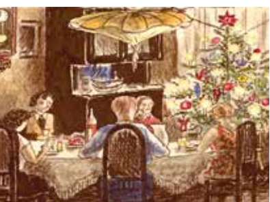
Eight Stars / Breakdown. Konstantins Raudive. / Little Bird's Diary

Founded in 2004, Studio CENTRUMS is a film production company that focuses on documentaries. The company has also been active in film distribution and other projects (computer games, a virtual museum, educational films and commercials).