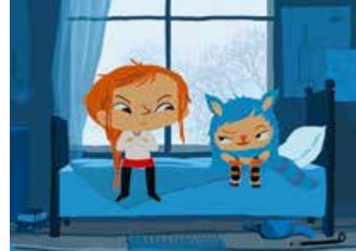
Jacob, Mimmi and the Talking Dogs / Letter to Milena / Pigtail and Mr Sleeplessness

Animation Studio Atom Art works in two main directions developing and producing quality children's content in different formats (TV specials, series and features) and producing artistic short films in various animation techniques.