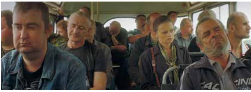
Homo Novus / A Gentle Creature

Film Angels Productions is currently the biggest and most active film production house in the Baltic region. It produces local commercial projects and music videos, and services international projects; its affiliate, Film Angels Studio, produces and services features and documentaries.