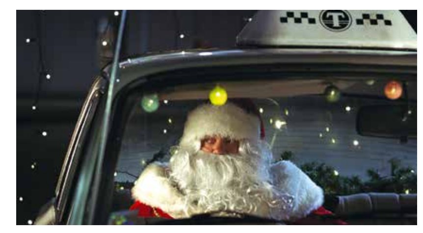
New Year's Eve Taxi In The Land that Sings Loss