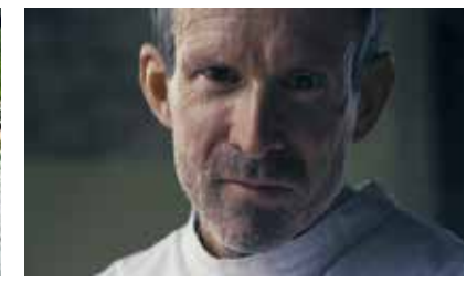
Before the Day Breaks / Christmas in the Jungle / Exiled

Founded in 1995, Locomotive Productions has become one of the most creative and productive film studios in the Baltic countries. Nearly all of its productions have premiered at recognised international film festivals. Latvia and Lithuania have submitted films co-produced by this company for the Academy Award.