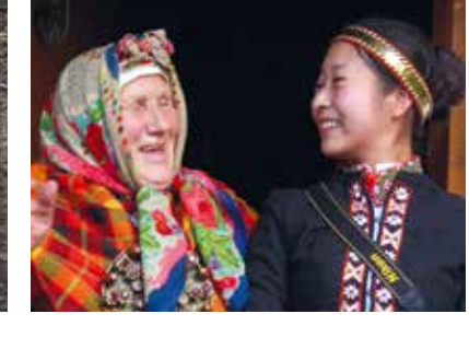
Bille / Soviet Milk / Ruch and Norie

Established in 1991, Film Studio DEVIŅI is an active player in the film industry. With a mission that includes the telling of compelling stories that both entertain and educate audiences, the company focuses on the co-production of feature films and documentaries.